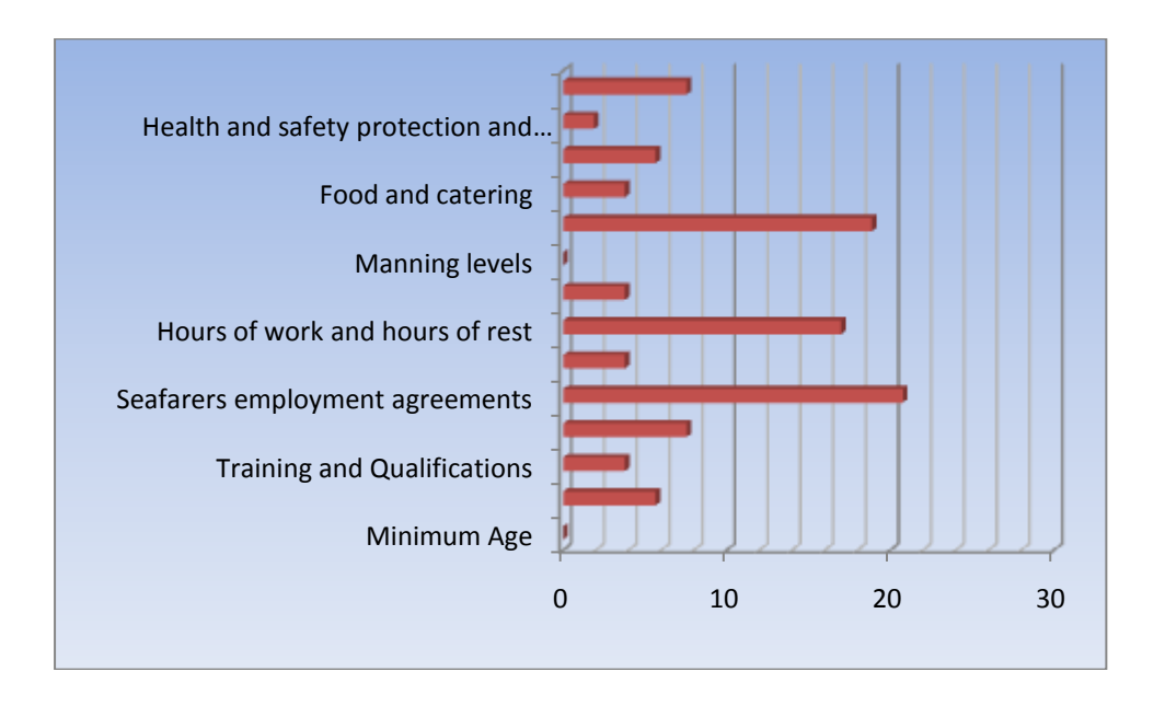
Figure 1: Deficiency categories percentage(%)